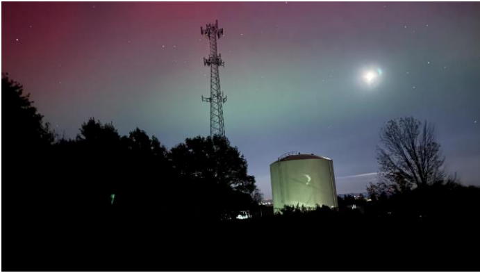
Northern Lights looking at the Bowerman Road water tank.