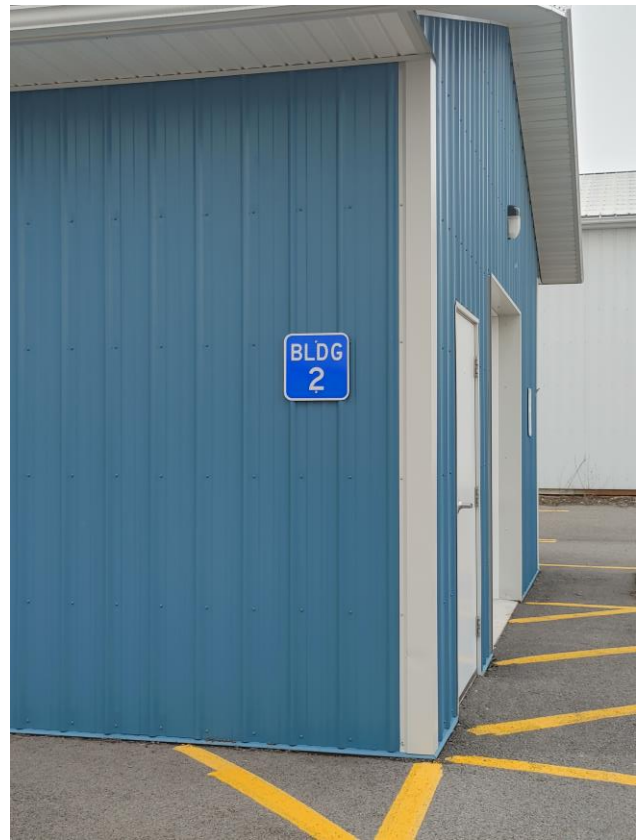
Swap Shop 5630 Collett Road