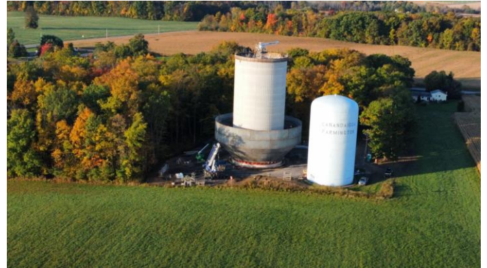
Brickyard Water Tank Project