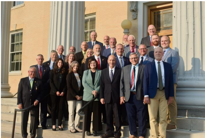
Ontario County Board of Supervisors

Questions? Please call (585)924-3158 or email macdonald@farmingtonny.org .