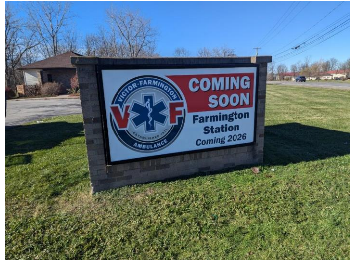
Victor-Farmington Ambulance – Farmington Station 2026